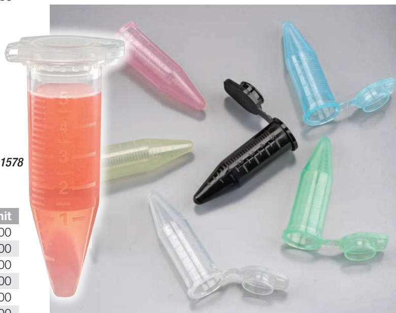
Diamond® Midi™ 5mL snap cap centrifuge tube colors (amber not shown).